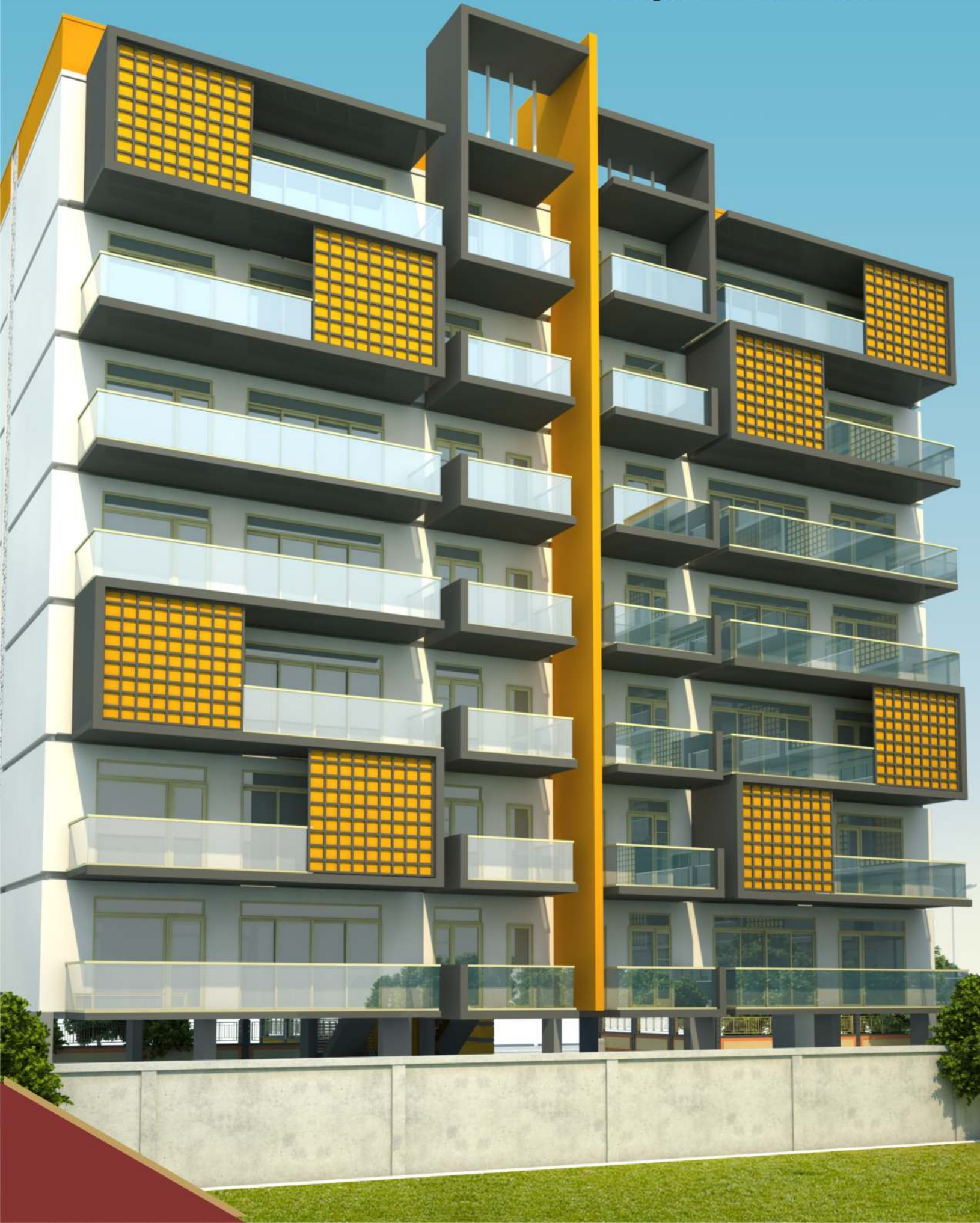
Perspective View of Tower - 1