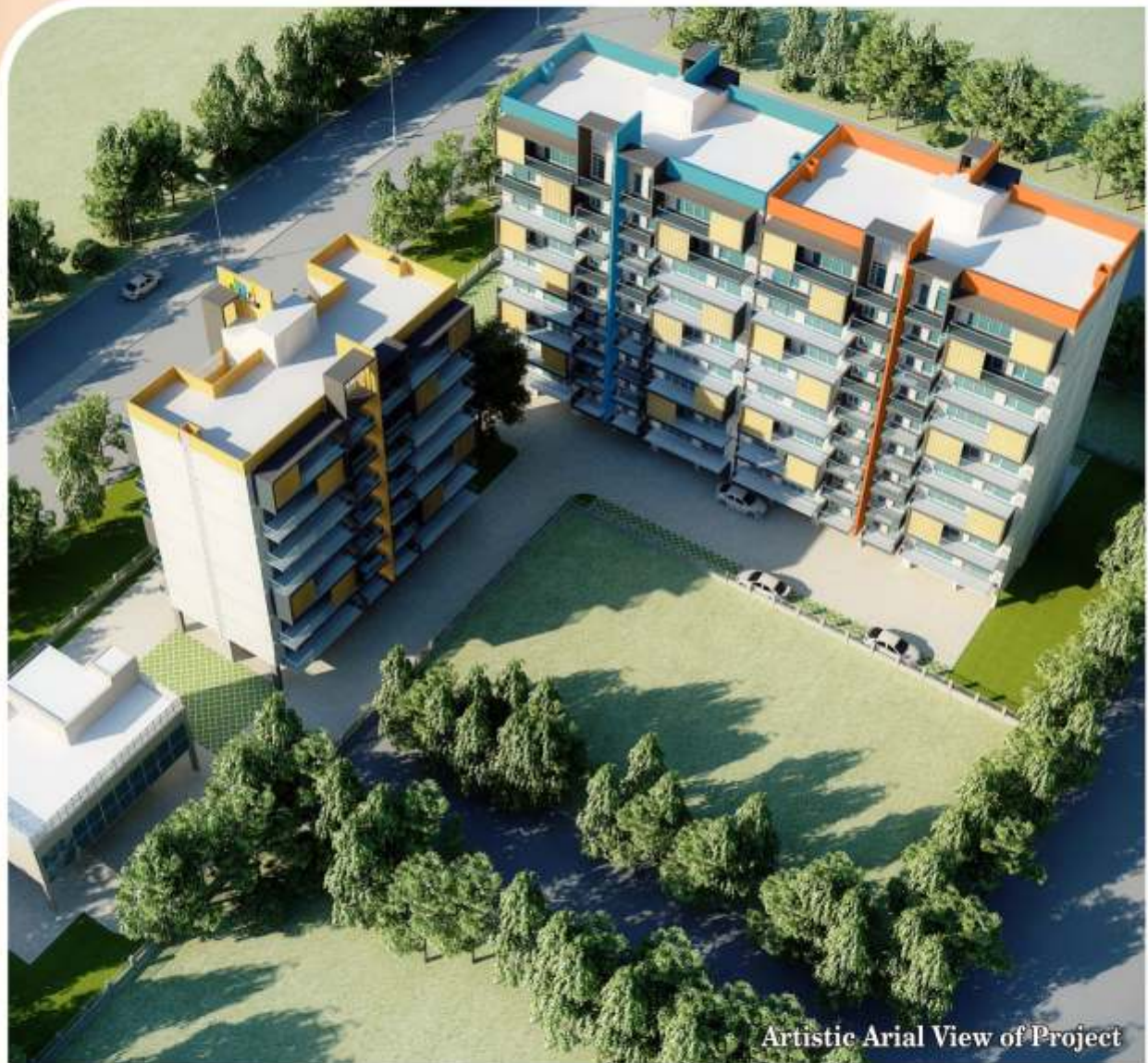
Artistic Arial View of Project