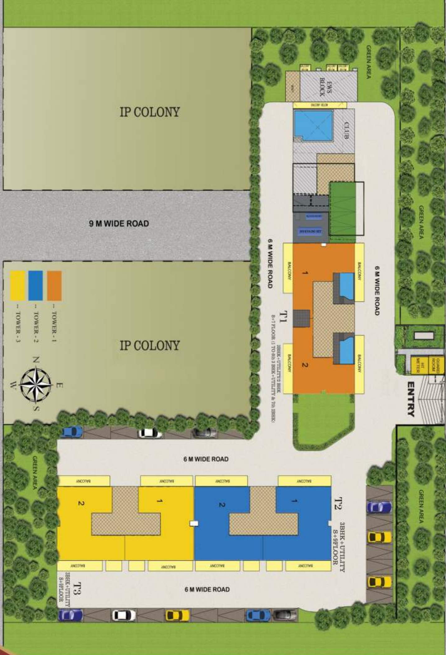
SITE LAYOUT OF INDRAPRASTHA APARTMENTS-II