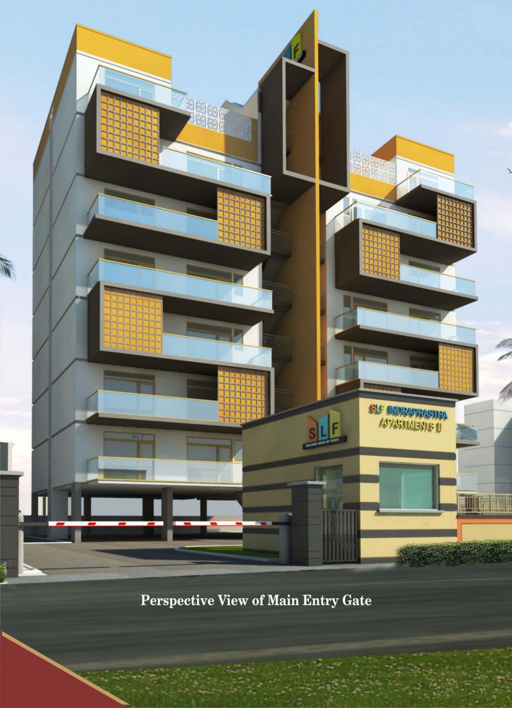
Perspective View of Main Entry Gate