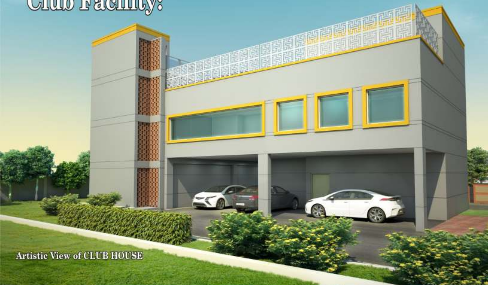
Artistic View of CLUB HOUSE